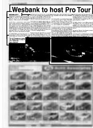
Wesbank to host Pro Tour